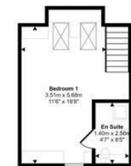
Second Floor Approx 27 sq m / 291 sq ft