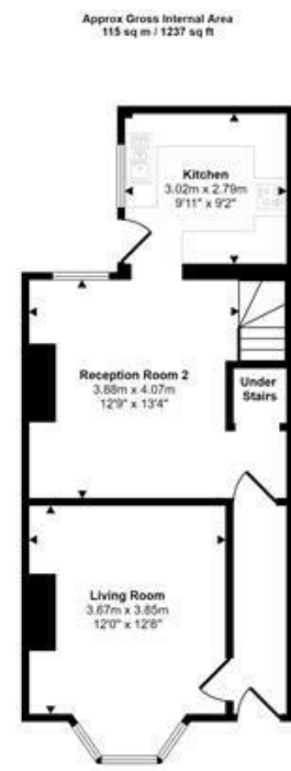
Ground Floor Approx 48 sq m / 530 sq ft