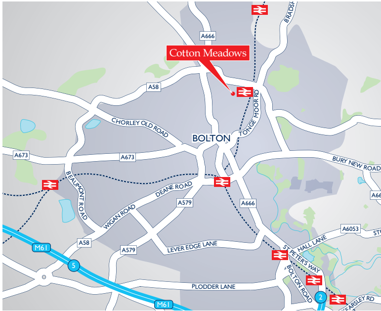
Cotton Meadows, Crompton Way, Bolton BL1 8UF