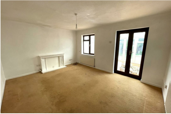
House - Terraced (EPC Rating: D)