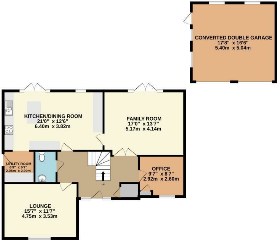
GROUND FLOOR 1274 sq.ft. (118.4 sq.m.) approx.