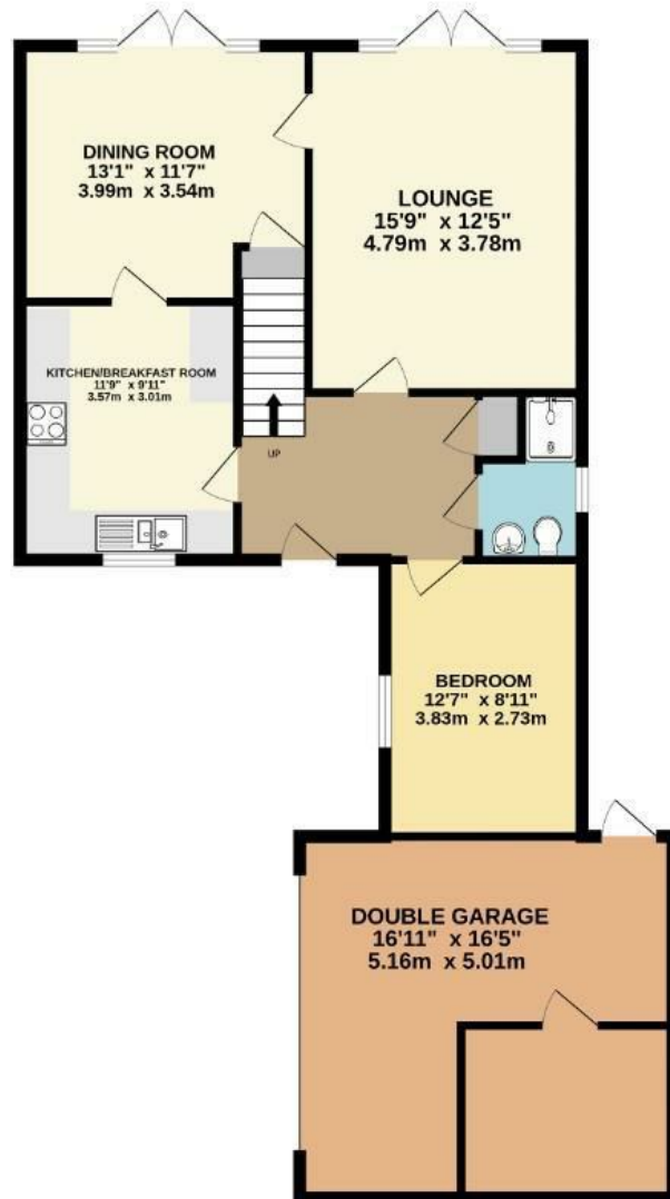
GROUND FLOOR 986 sq.ft. (91.6 sq.m.) approx.