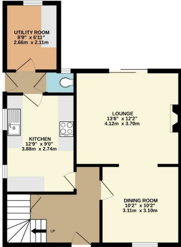
GROUND FLOOR 559 sq.ft. (52.0 sq.m.) approx.