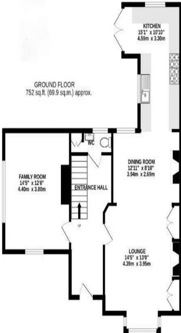
GROUND FLOOR 752 sq.ft. (69.9 sq.m.) approx.