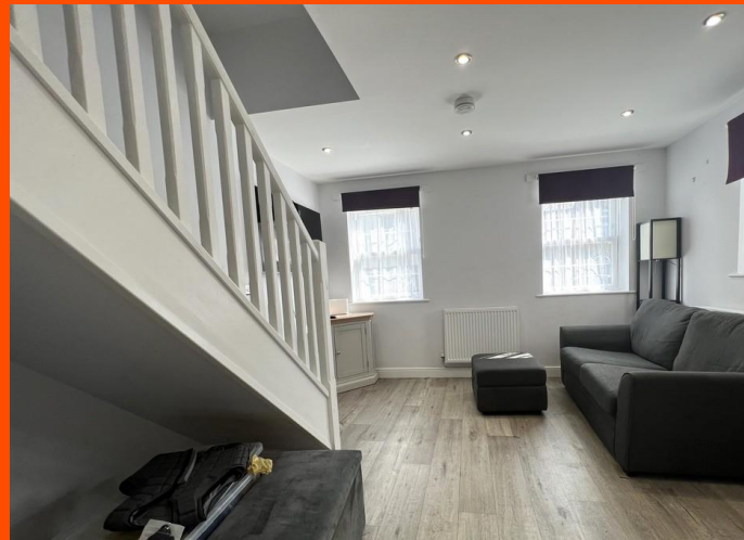
Ash Grove, Chatteris, Cambs, PE16 6NL

Close To The Town Centre - Modern End Terraced House - 2 Bedrooms - Kitchen/Breakfast Room & Lounge - First Floor Bathroom & Ground Floor WC – Space For Parking - Deposit £980.76 - EPC Rating: B - Council Tax Band A - Call to view (01354) 696700