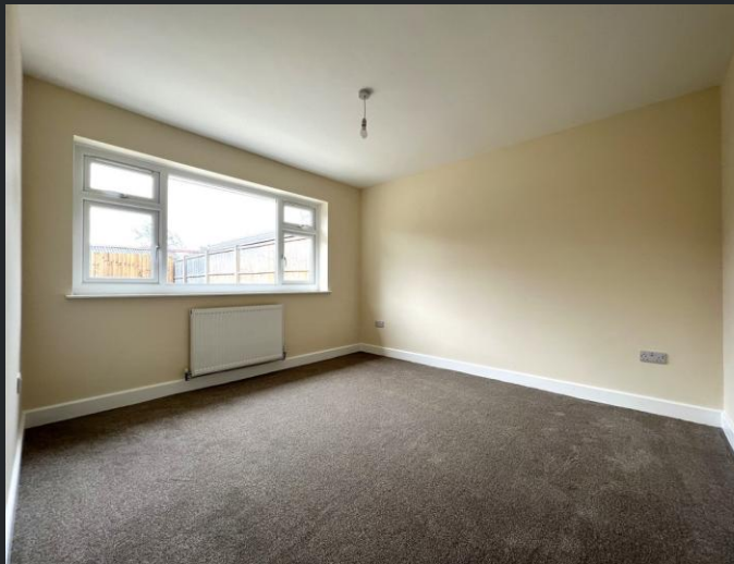
Bedroom 2 2.68m (8'10") x 2.51m (8'3") Double glazed window to rear, fitted carpet and radiator.

Bedroom 1 3.53m (11'7") x 3.20m (10'6") Double glazed window to rear, fitted carpet and radiator.