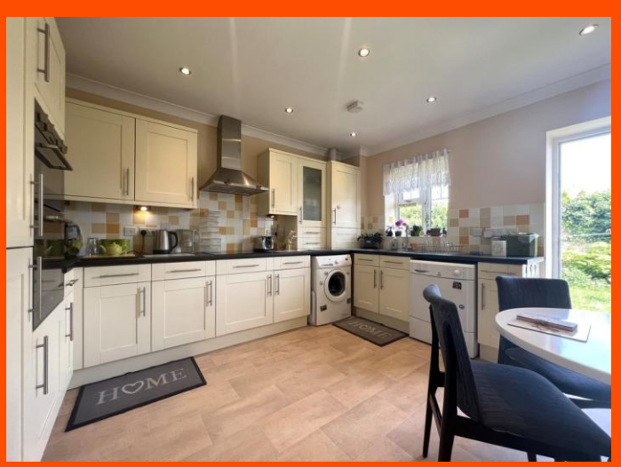
Lime Tree Gardens, Chatteris, Cambs, PE16 6GE

Cul De Sac Location - Close to Town Centre - Detached Bungalow - 2 Double Bedrooms - Kitchen/Breakfast Room - Lounge/Diner - Shower Room & En-suite to Master - Front & Rear Gardens - Single Garage & Driveway - Call To View (01354) 696700