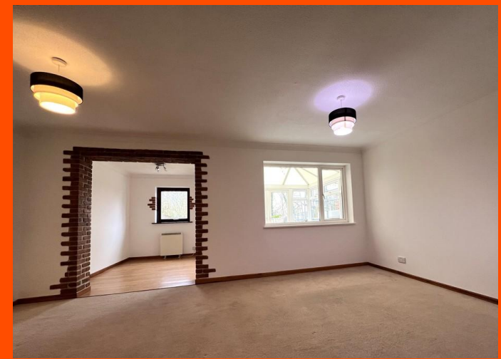
Link Lane, Sutton, Ely, Cambs, CB6 2NF

Popular Village Location - Semi Detached House - 3 Bedrooms - Lounge, Dining Room & Conservatory - First Floor Bathroom - Enclosed Rear Garden - Off Road Parking - Available Now - Deposit £1,269.23 - Council Tax Band B - EPC Rating E - Call To View (01354) 696700