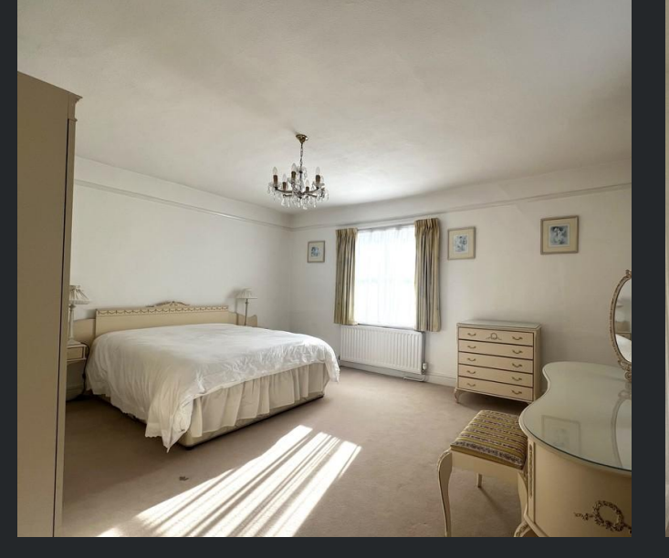
Bedroom 3 3.79m (12'5") x 3.67m (12')