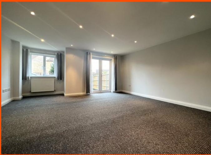
Bridge Street, Chatteris, Cambs, PE16 6RD

Immaculately Presented - Modern Mid Terraced House - 3 Bedrooms - Kitchen & Lounge Diner - Family Bathroom & Ground Floor WC - Enclosed Rear Garden - Allocated Parking - Call To View - (01354) 696700