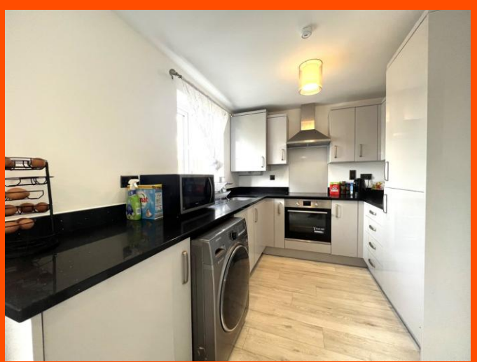
Fillenham Way, Chatteris, Cambs, PE16 6FX

Built in 2023 - Detached House - 3 Bedrooms - Kitchen/Diner - Lounge - En-Suite, Family Bathroom & Ground Floor WC - Enclosed Rear Garden - Driveway & Single Garage - EPC Rating -B - Call To View (01354) 696700