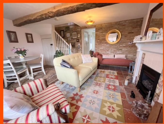
Railway Lane, Chatteris, Cambs, PE16 6NF

Beautifully Presented - Semi-Detached Cottage - 2 Bedrooms - Kitchen - Lounge/Diner - Ground Floor Bathroom - Enclosed Rear Garden - Parking To The Front - Call To View - (01354) 696700.