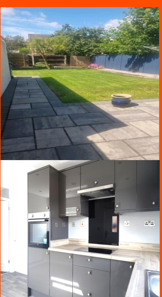
109 Green Park, Chatteris, Cambs, PE16 6DN

Popular Area - Semi Detached Bungalow - 2 Bedrooms - Lounge - Recently Refitted Kitchen/Diner & Shower Room - Garage & Driveway Parking - Enclosed rear garden - Call To View - (01354) 696700