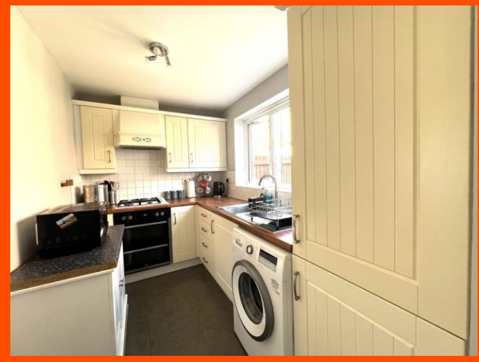
39 Farriers Gate, Chatteris, Cambs, PE16 6AY

Close To Town Centre - Mid-Terraced House - 3 Bedrooms - Kitchen - Lounge/Diner - Bathroom & Ground Floor WC - Enclosed Rear Garden - Driveway & Garage - Call To View (01354) 696700