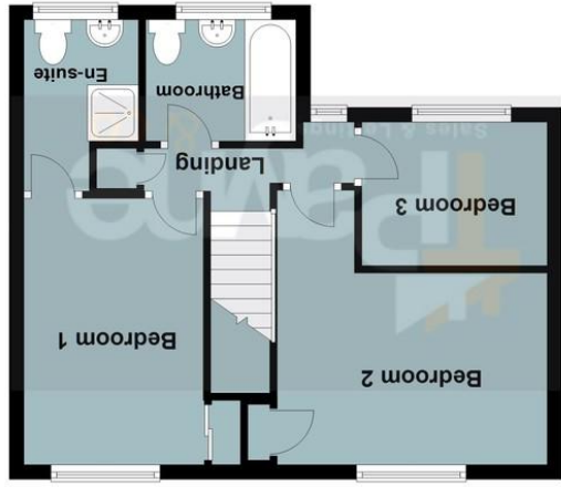
First Floor Approx. 39.2 sq. metres (421.4 sq. feet)

Total area: approx. 90.2 sq. metres (971.4 sq. feet)