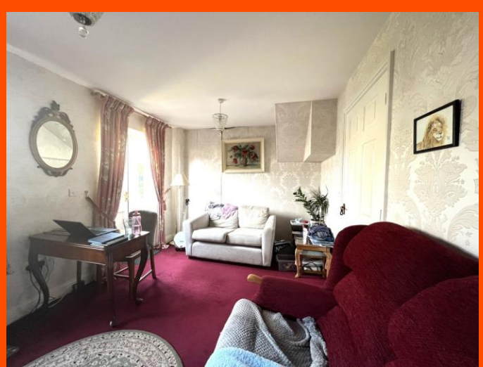
Furrowfields Road, Chatteris, Cambs, PE16 6DY

Close Proximity To The Town Centre - End Terraced House - 2 Bedrooms - Kitchen - Lounge - Shower Room & Ground Floor WC - Rear Garden - Off Road Parking - No Upward Chain - Call To View - (01354) 696700