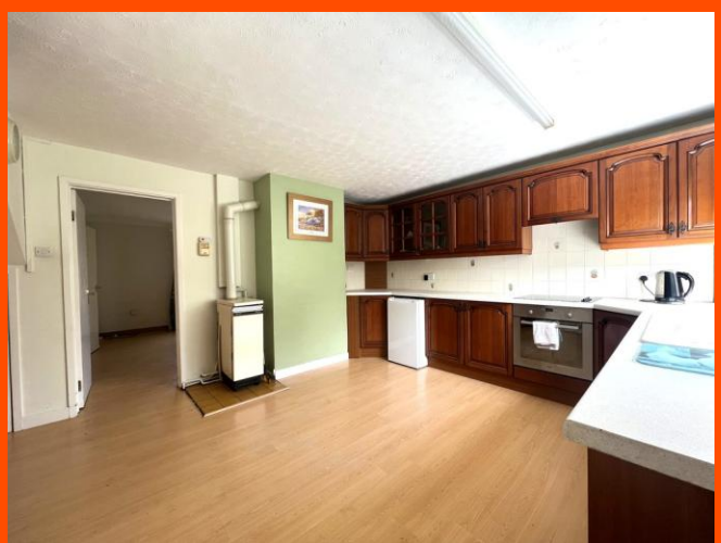
West Street, Chatteris, Cambs, PE16 6HR

Updating Required - Mid Terraced House - 3 Bedrooms - Kitchen/Diner - Lounge - Bathroom & Ground Floor WC - Front & Rear Garden - No Upward Chain - Call To View (01354 696700)