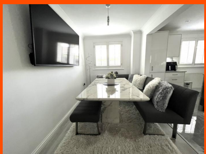
31 Old West Estate, Benwick, March, Cambs, PE15 0XE

Village Location - End Terraced House - 3 Bedrooms - Kitchen/Breakfast Room - Lounge - Bathroom - Covered Car Port - Rear Garden - No Upward Chain - Call To View - (01354) 696700