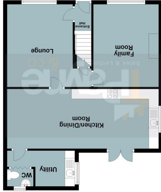
Ground Floor Approx. 59.1 sq. metres (636.1 sq. feet)