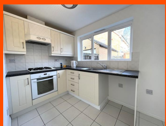
Farriers Gate, Chatteris, Cambs, PE16 6AY

End Terraced House - 2 Bedrooms - Kitchen - Lounge - Bathroom & Ground Floor WC - Enclosed Rear Garden - Allocated Parking - No Upward Chain - Call To View (01354) 696700