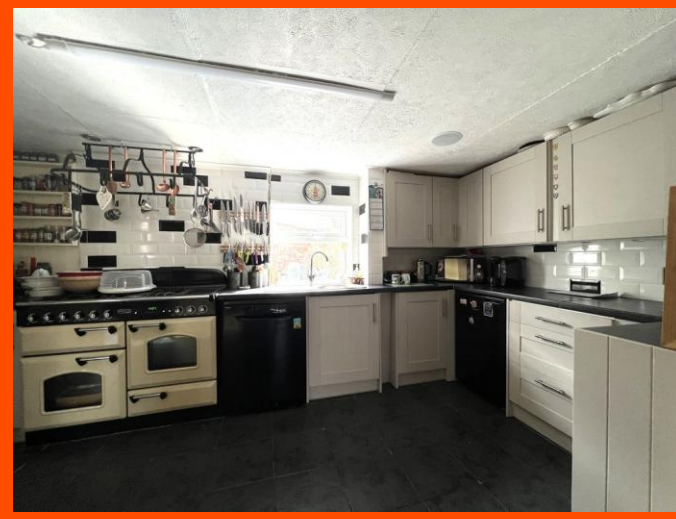
Station Street, Chatteris, Cambs, PE16 6EL

Grade II Listed - Semi Detached House - 3 Bedrooms - Kitchen & Utility - Lounge & Dining Room - Bathroom - Enclosed Rear Garden - No Upward chain - Call To View (01354) 696700