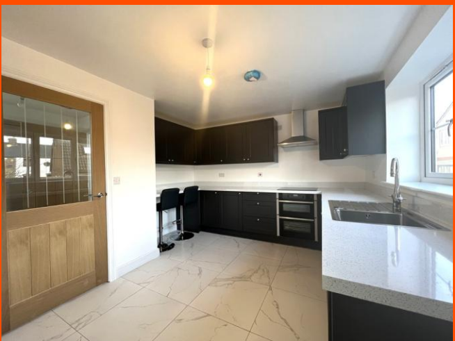
Chapel Lane, Chatteris, Cambs, PE16 6RJ

New Build - Semi- Detached House - Finished To A High Standard - 2 Double Bedrooms - Kitchen/Breakfast Room - Lounge - Ground Floor WC & First Floor Four Piece Bathroom - Enclosed Rear Garden & Gated Driveway - No Upward Chain - Call To View (01354) 696700