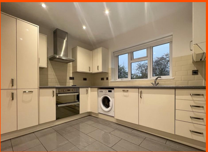
Lode Way, Chatteris, Cambs, PE16 6TN

Cul- De- Sac Location - Newly Decorated - Detached Bungalow - 3 Bedrooms - Kitchen - Lounge - Enclosed Rear Garden - Single Garage & Off Road Parking - No Upward Chain - Call To View (01354) 696700