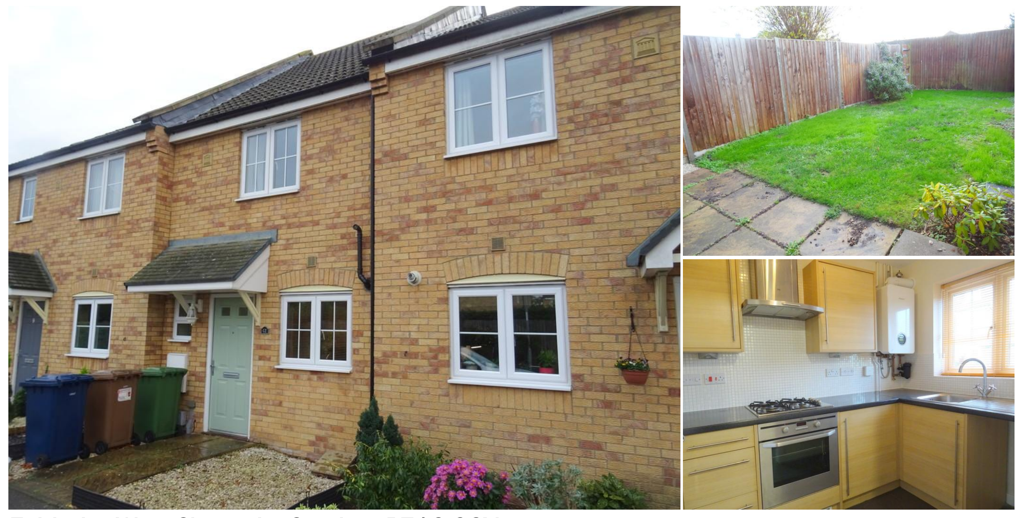
Fairbairn Way, Chatteris, Cambs., PE16 6GY

Well Presented - Popular Location - Mid Terraced House - 2 Bedrooms - Kitchen & Lounge/Diner - Family Bathroom & Ground Floor WC - Enclosed Rear Garden - Garage & Off Road Parking - Available Now - Deposit £865.38 - Call To View - (01354) 696700