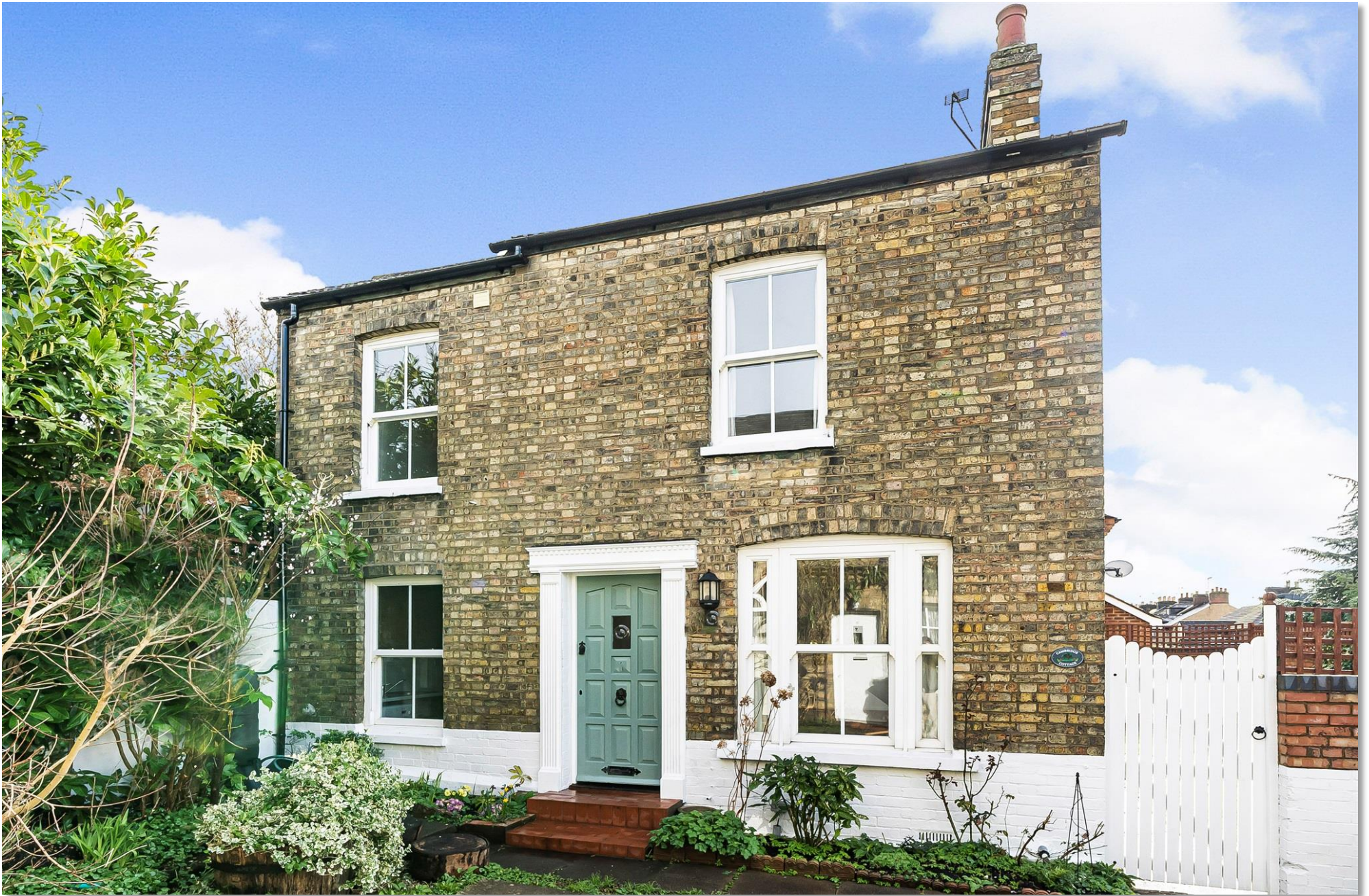
Cambridge Terrace, Berkhamsted HP4 2EH