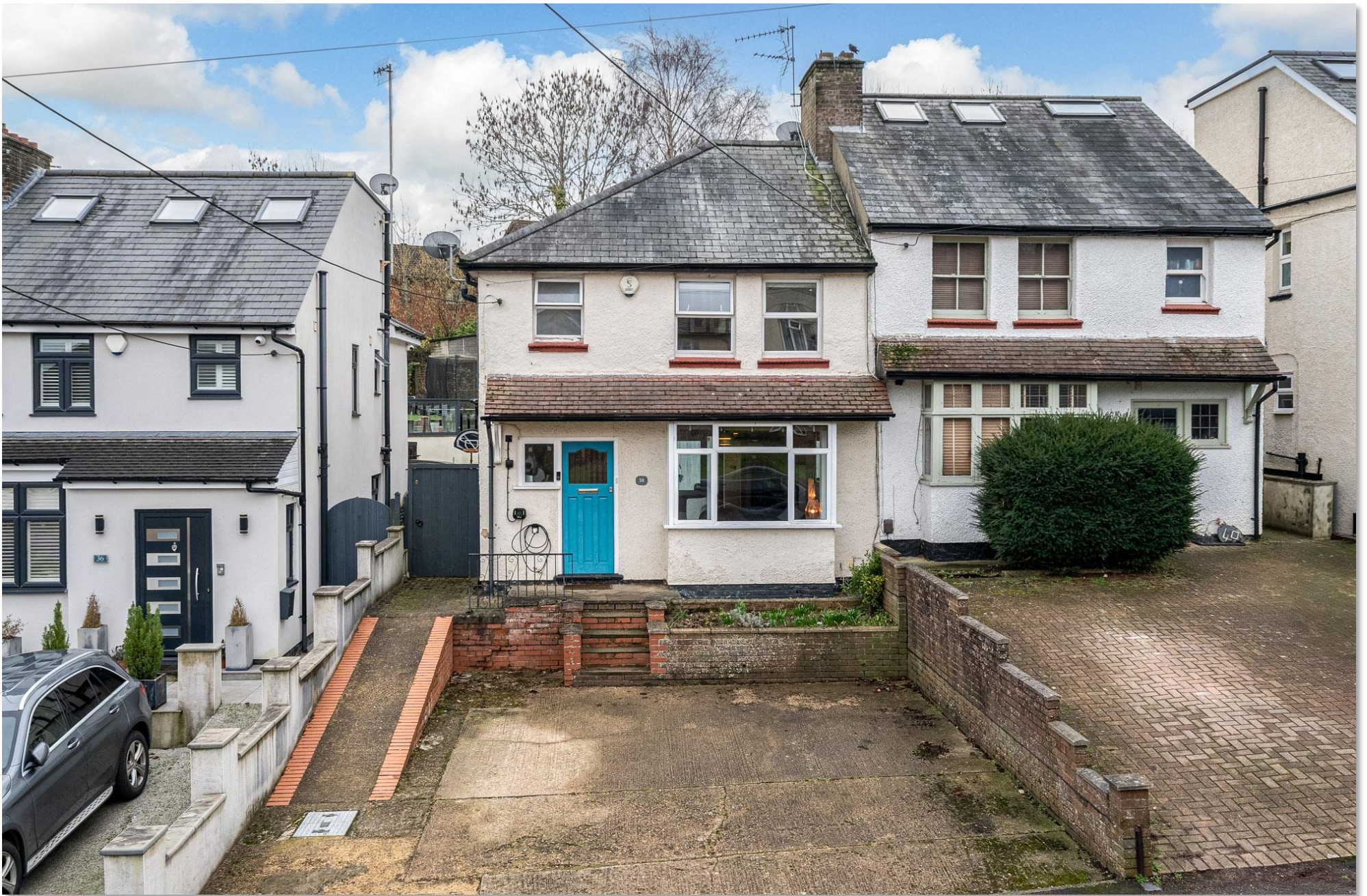
Woodlands Avenue, Berkhamsted HP4 2JQ