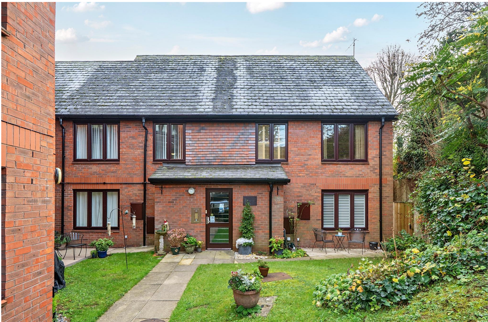
Nightingale Lodge Cowper Road, Berkhamsted HP4 3ED