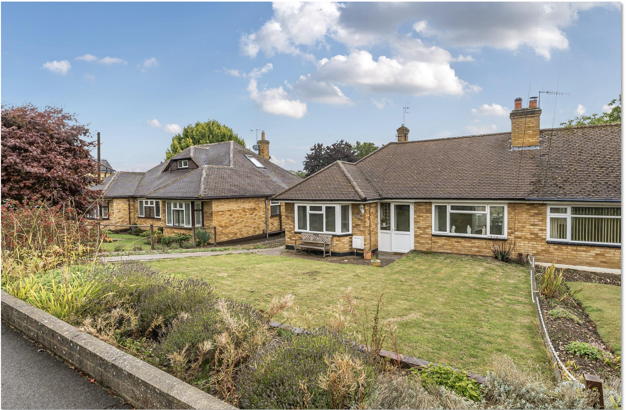
Covert Road, Northchurch Berkhamsted HP4 3RR