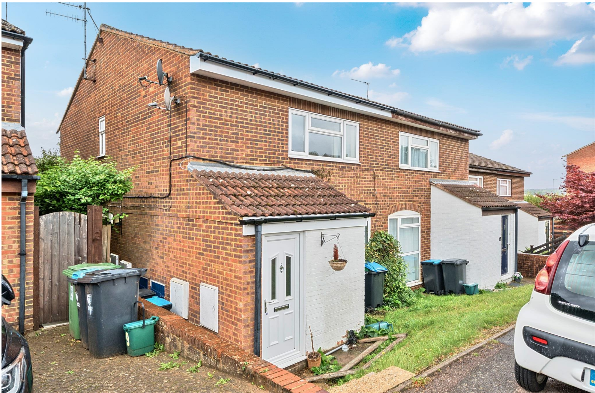
Montgomerie Close, Berkhamsted HP4 1JX