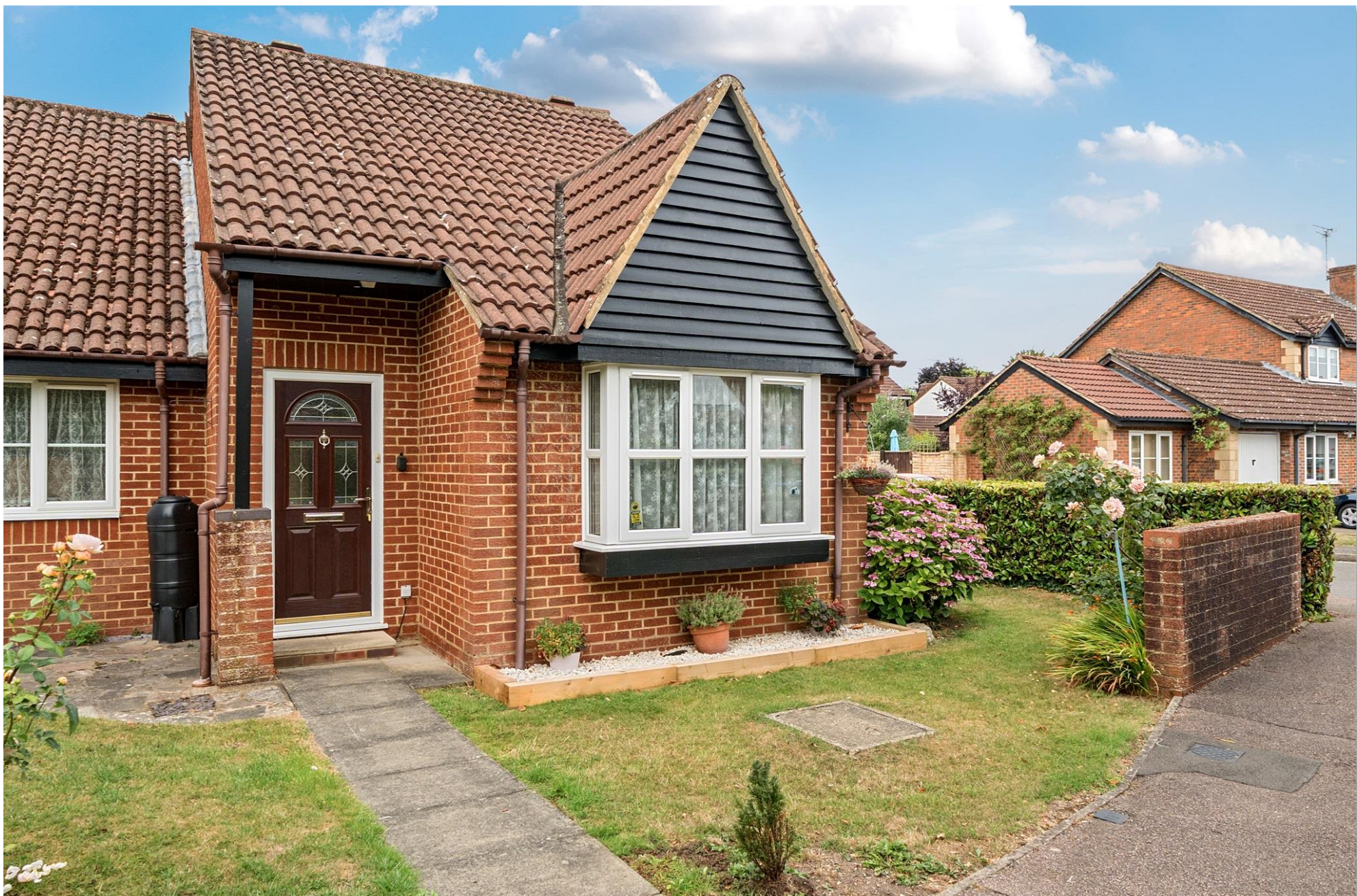
Emerton Garth, Northchurch Berkhamsted HP4 3XJ