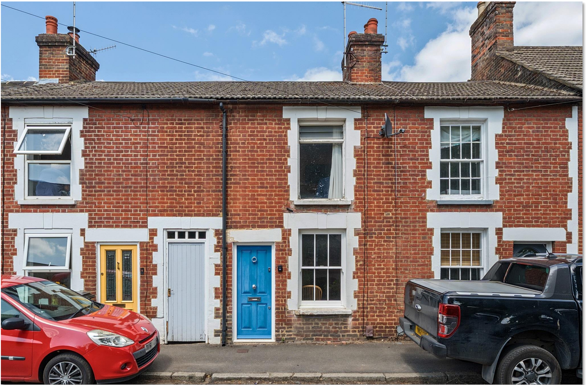
George Street, Berkhamsted HP4 2EQ