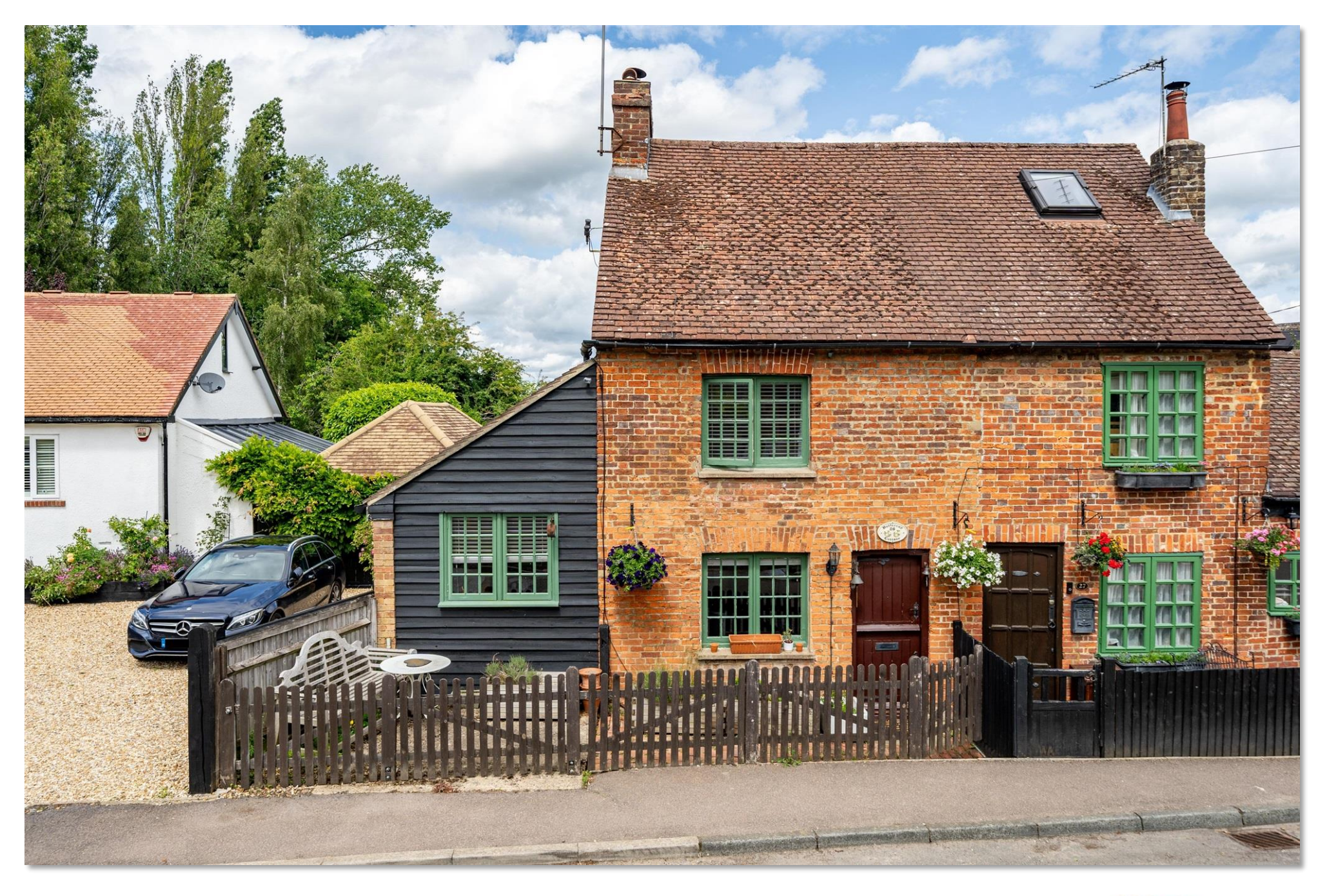
The Front, Potten End Berkhamsted HP4 2QR