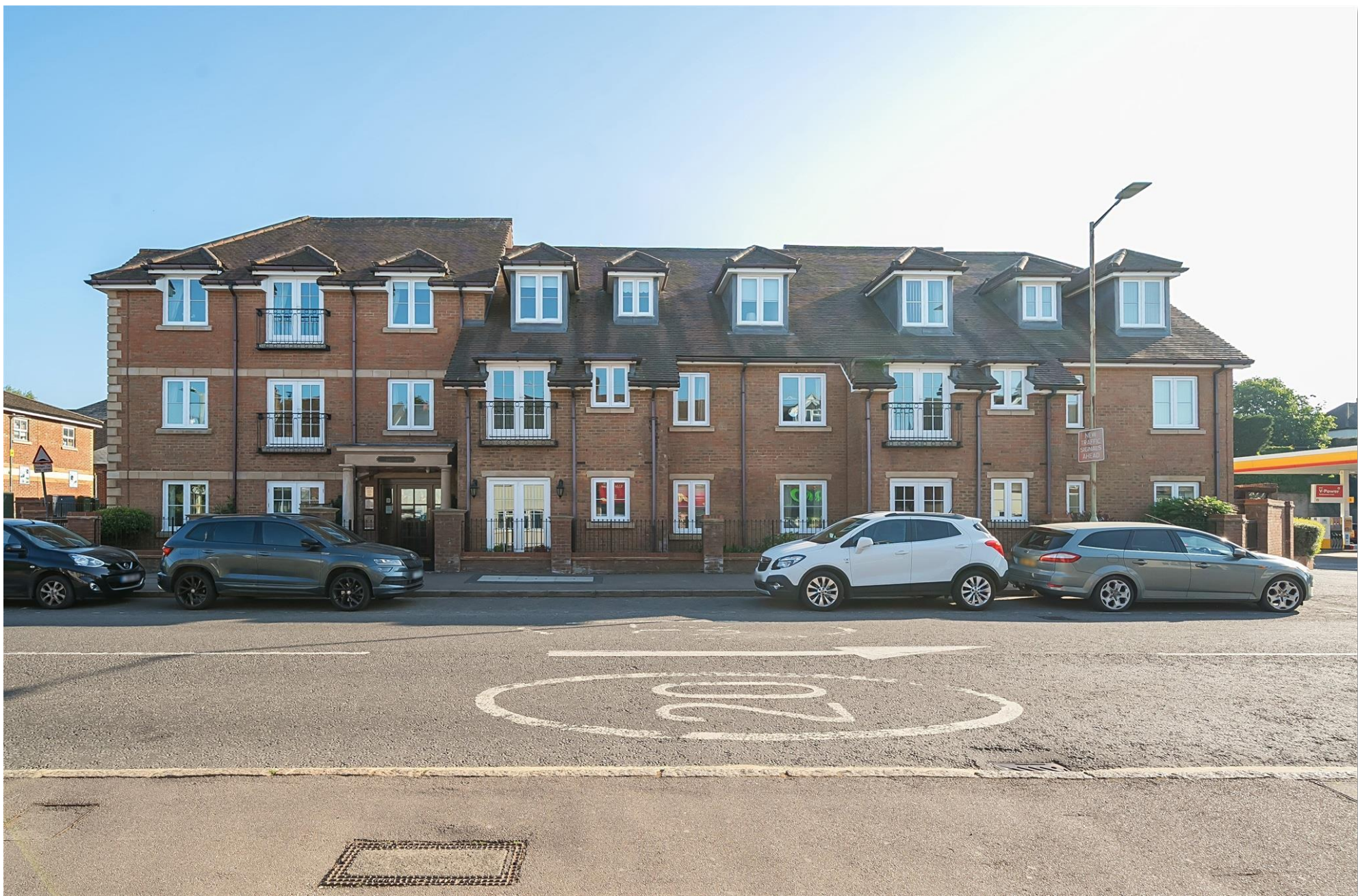
Gilhams Court High Street, Berkhamsted HP4 1AT