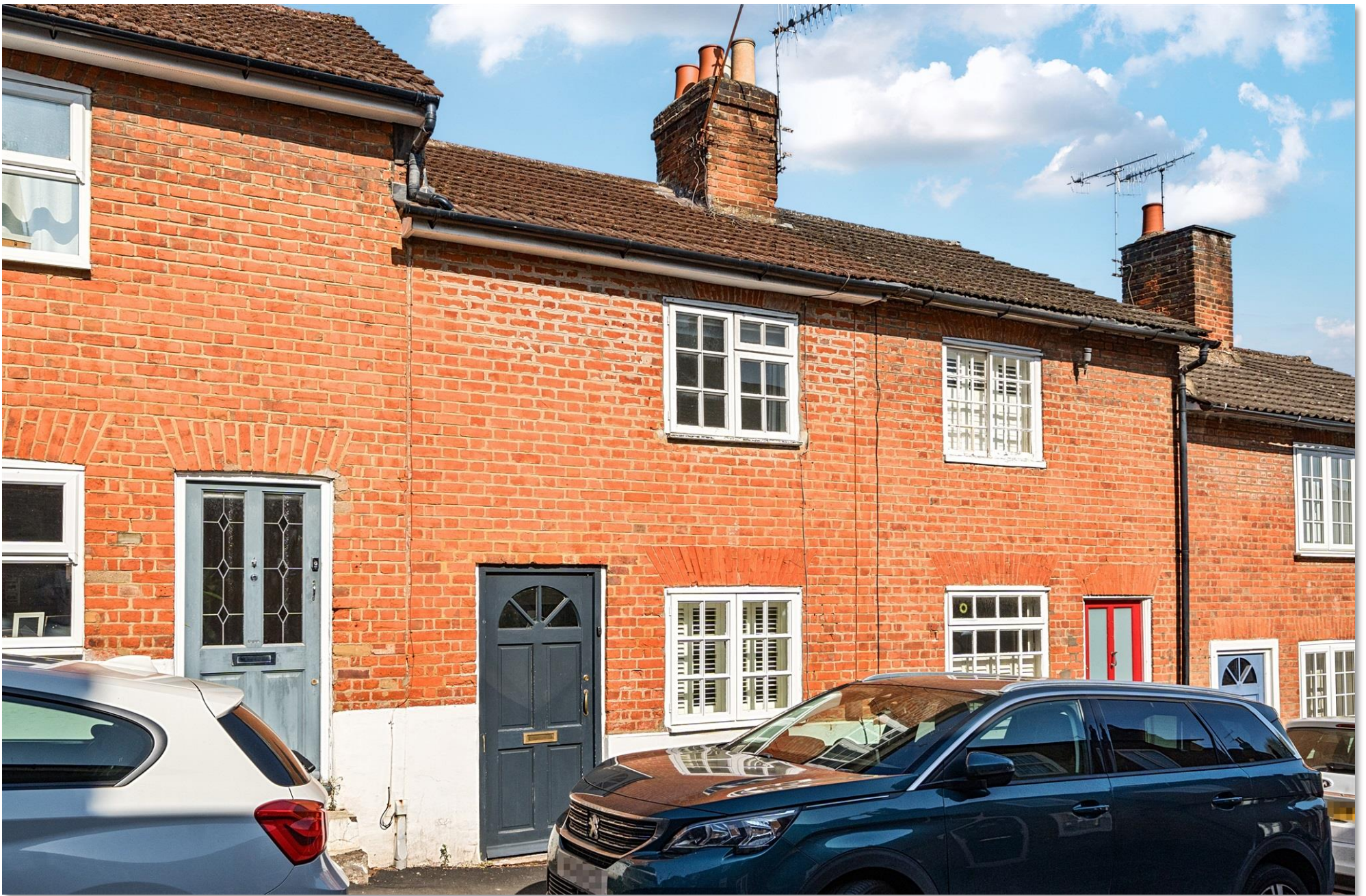
Highfield Road, Berkhamsted HP4 2DA