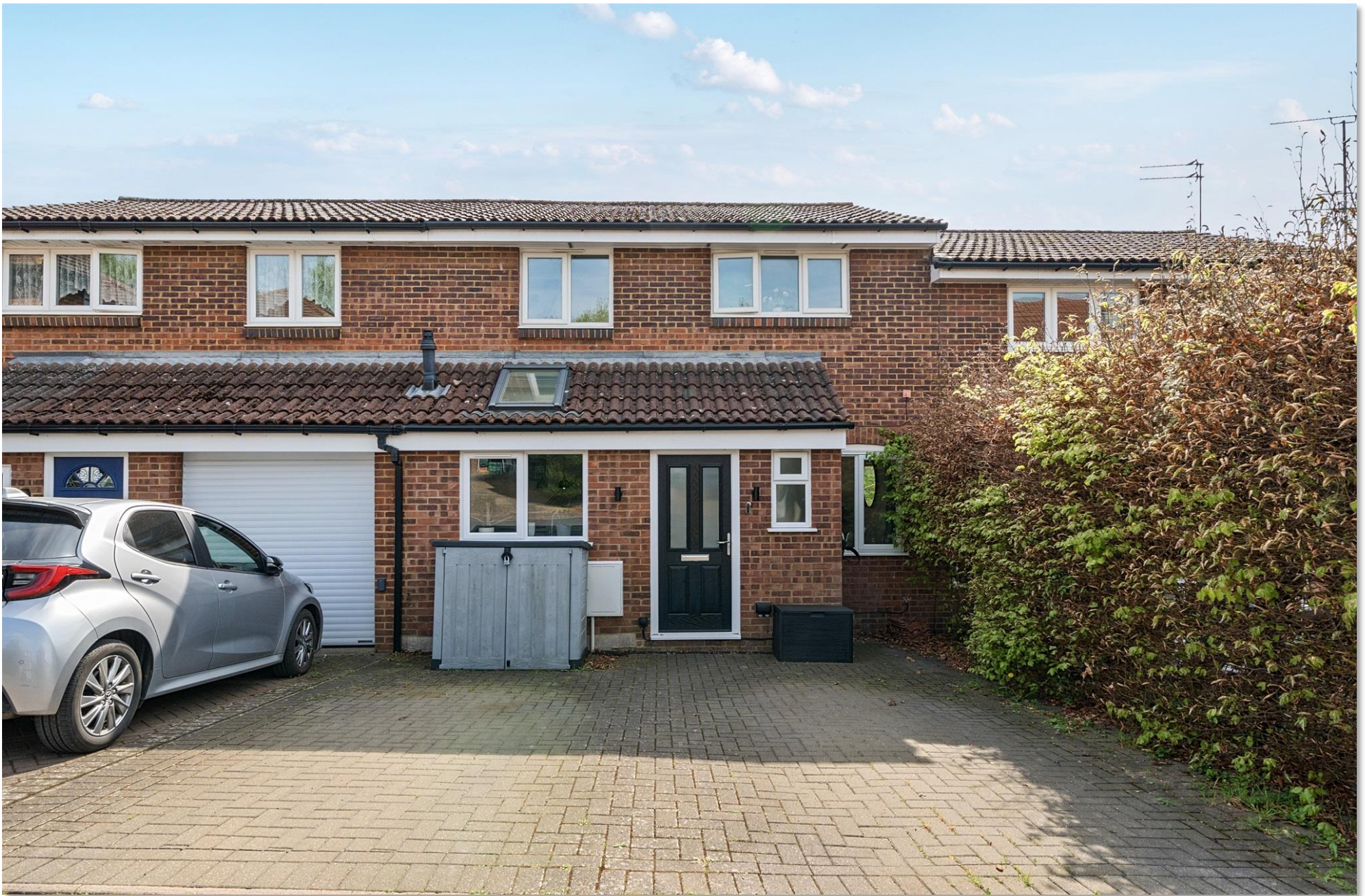
Montgomerie Close, Berkhamsted HP4 1JX