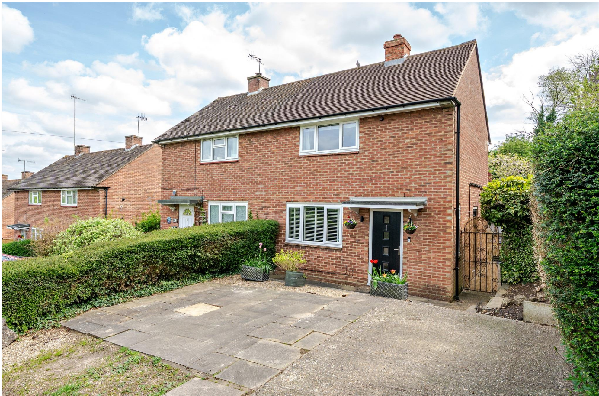
Durrants Lane, BERKHAMSTED HP4 3PL