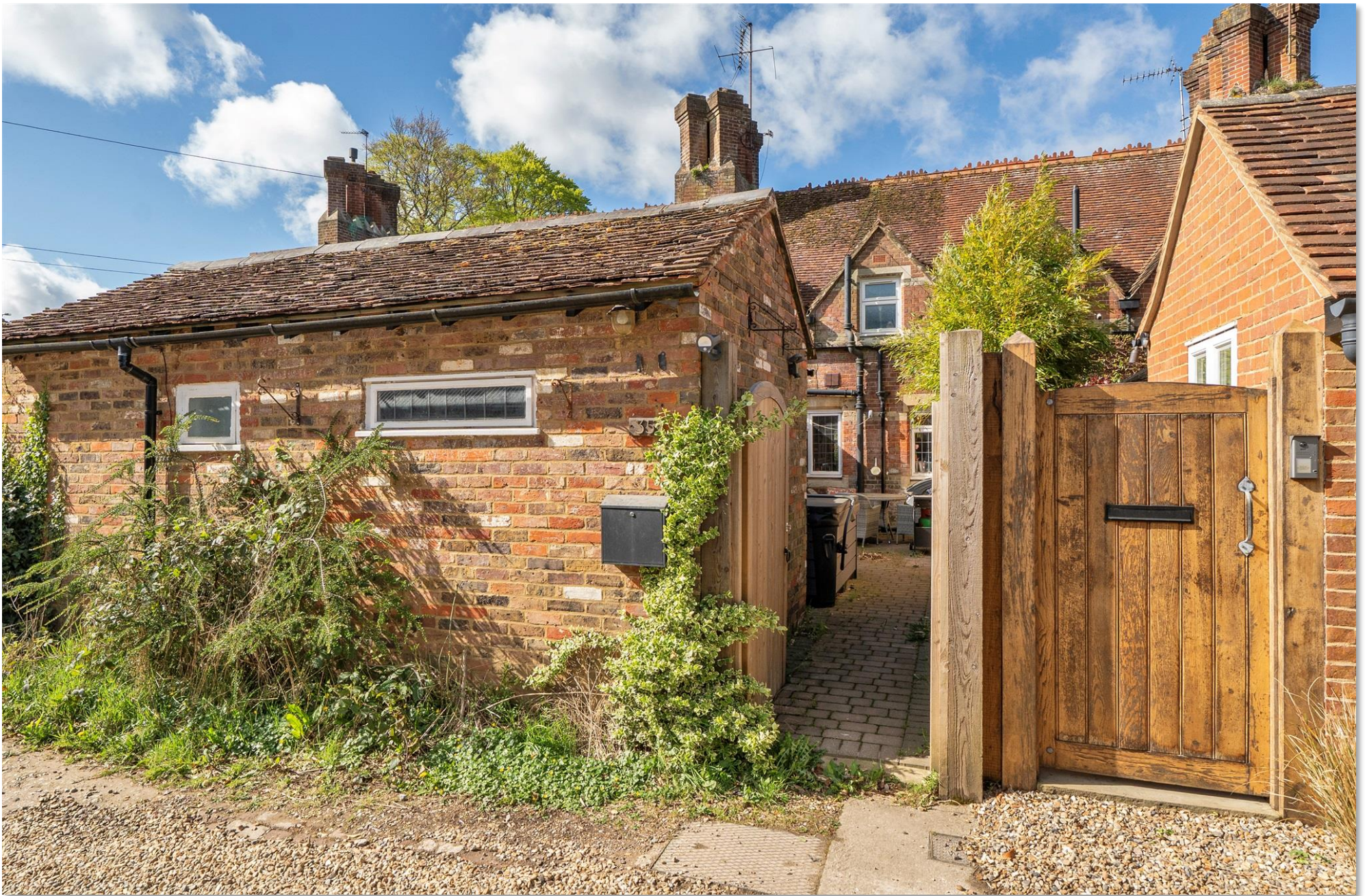
Little Gaddesden, Little Gaddesden Berkhamsted HP4 1PF