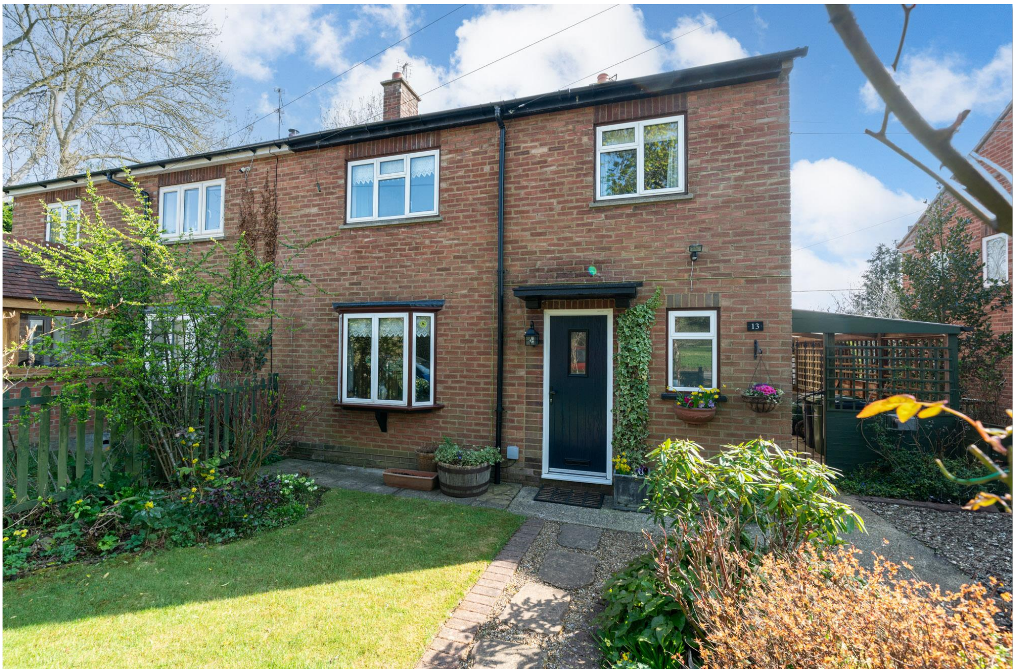
Sandpit Hill Cottages Cholesbury Lane, Cholesbury Tring HP23 6NF