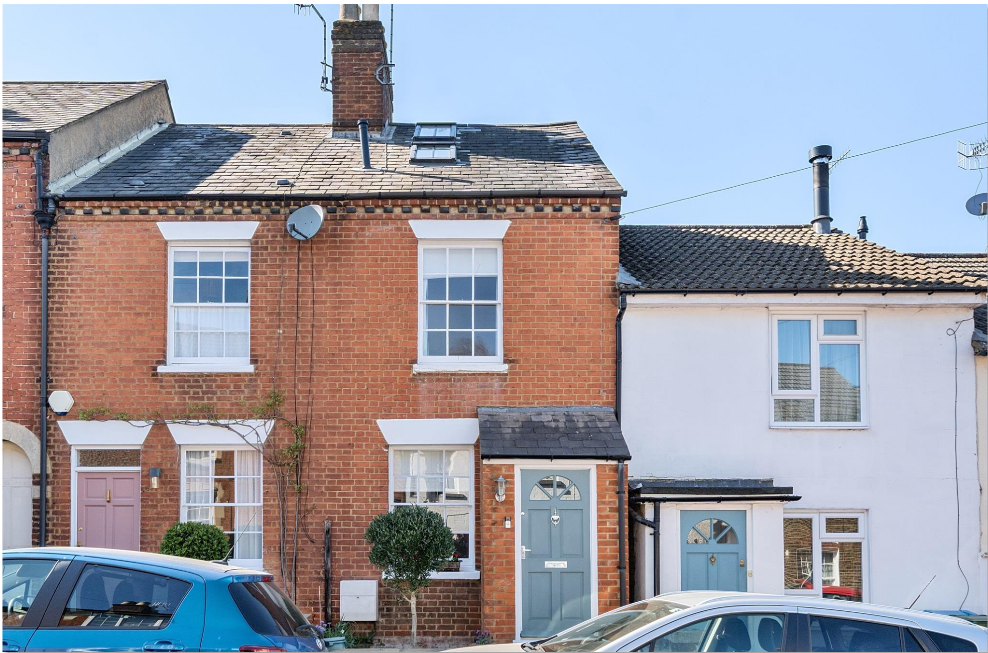
Victoria Road, Berkhamsted HP4 2JT