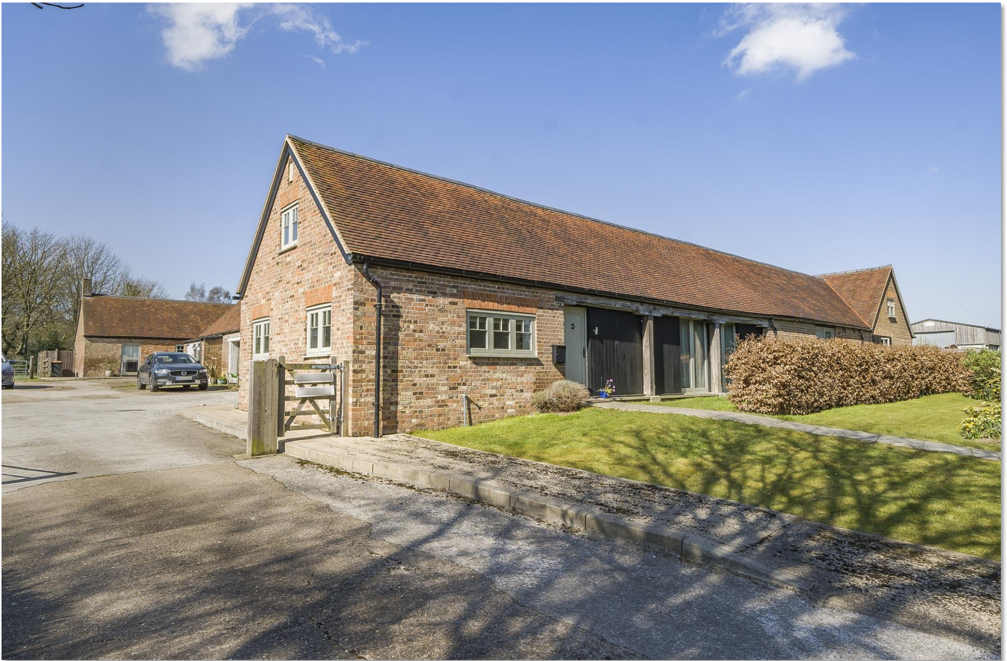
Hill Farm Barns, Whipnade Dunstable LU6 2LN