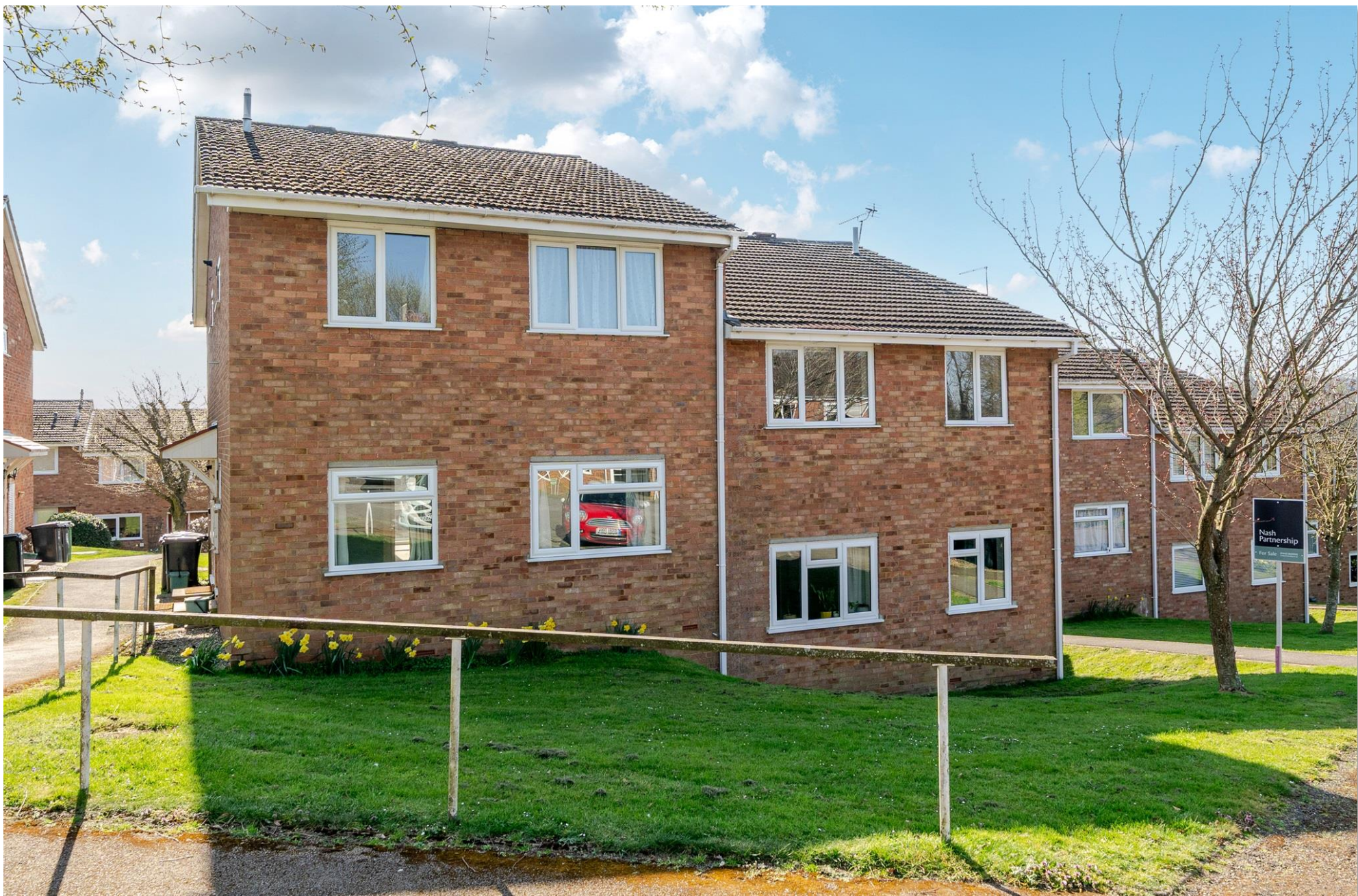
Chiltern Park Avenue, Berkhamsted HP4 1EY