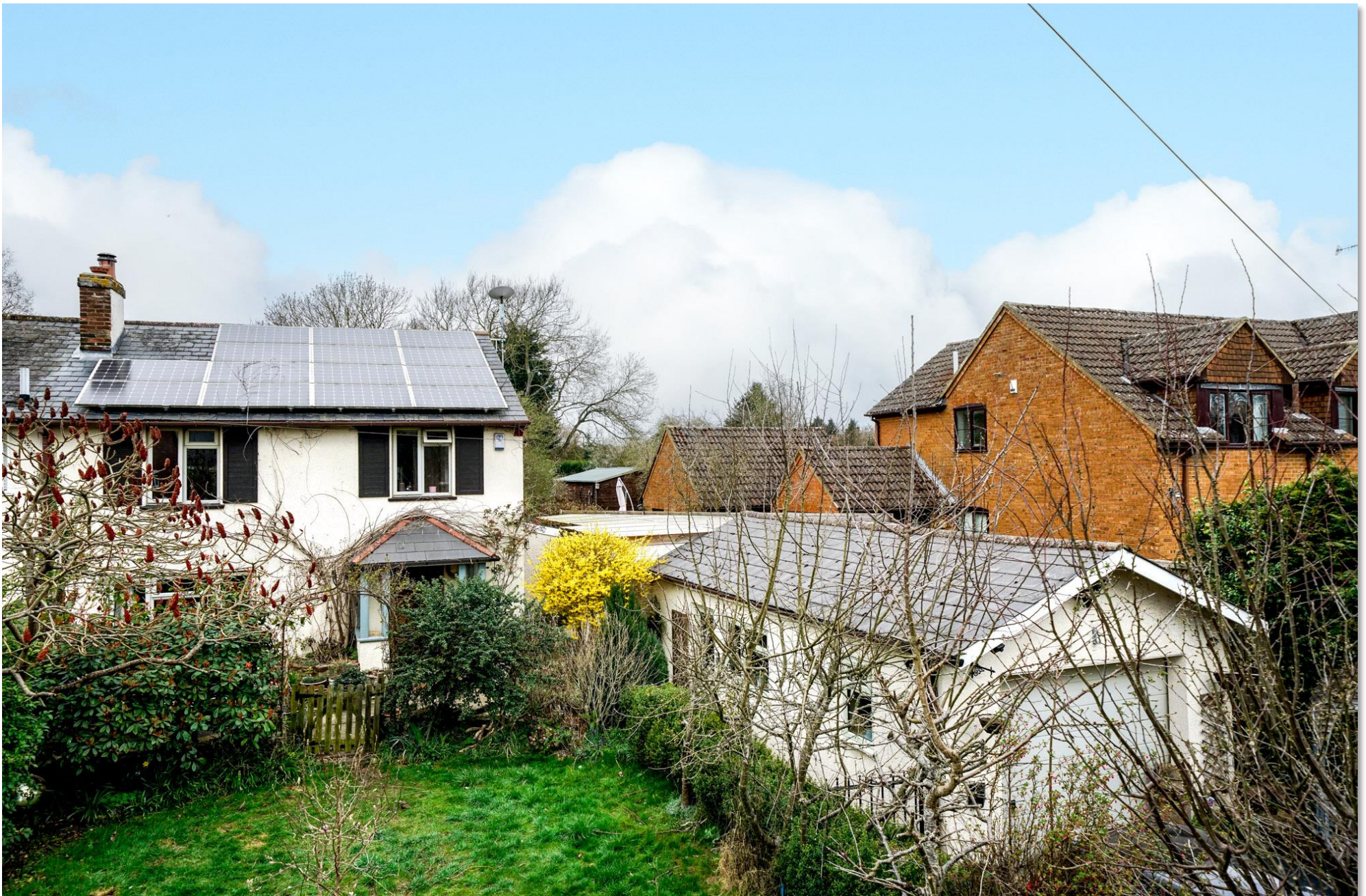
Bourne End Lane Hemel Hempstead, Hertfordshire HP1 2RL