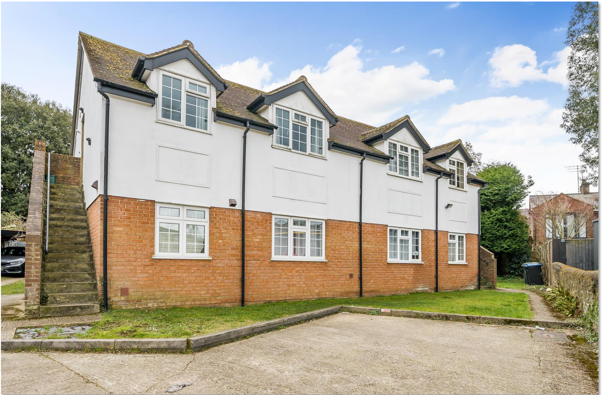
Little Court Riverside Gardens, Berkhamsted HP4 1AR