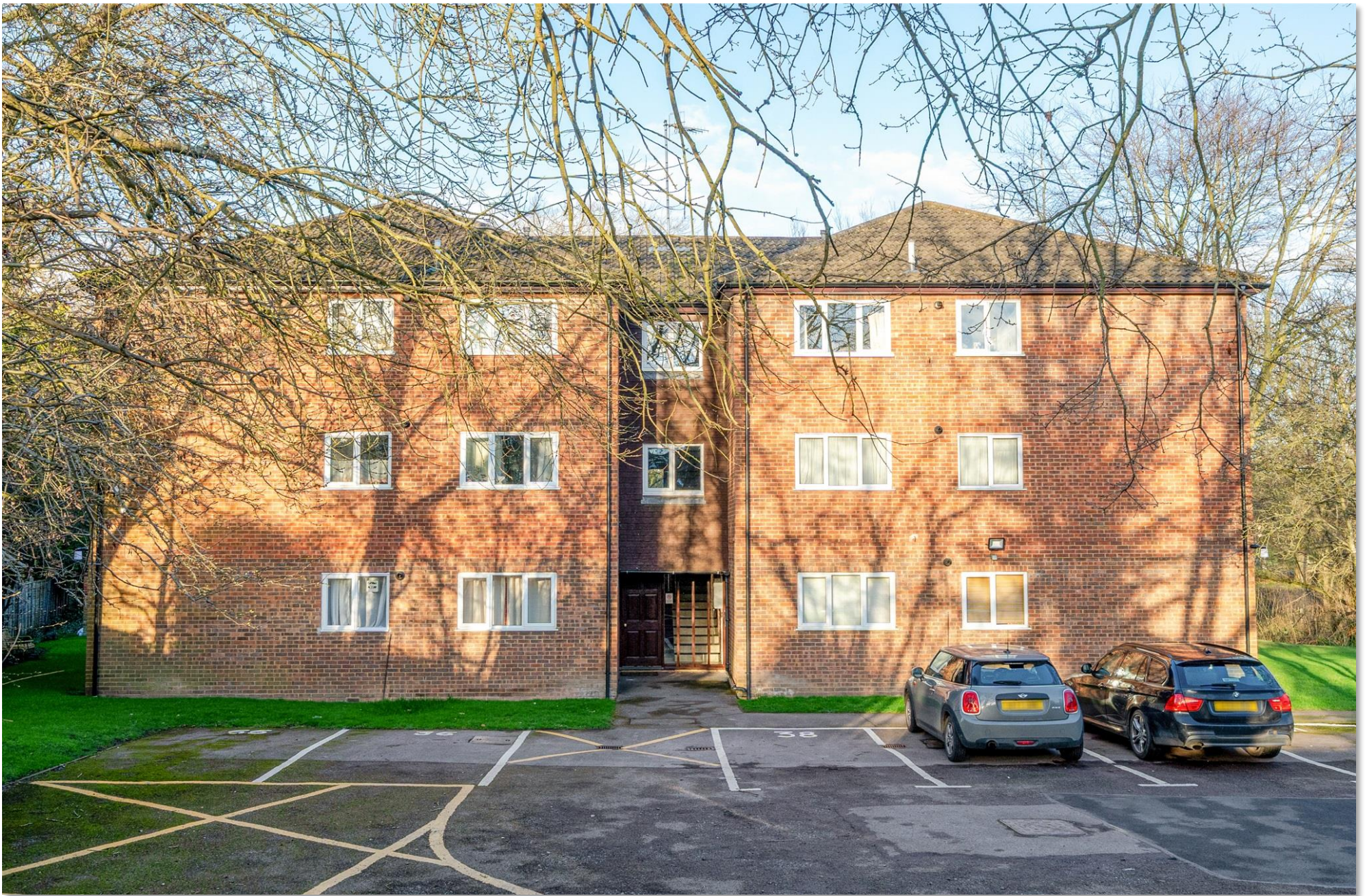
St Johns Well Court St Johns Well Lane, Berkhamsted HP4 1JQ