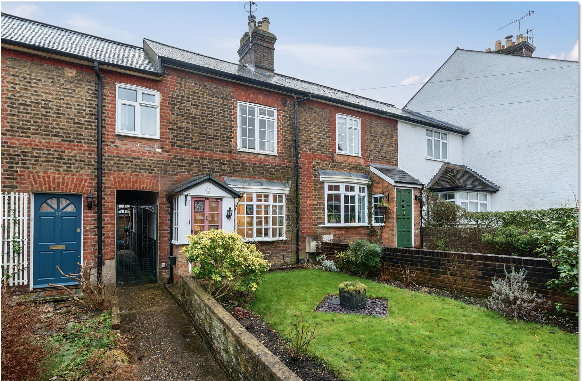
Cross Oak Road, Berkhamsted HP4 3EH