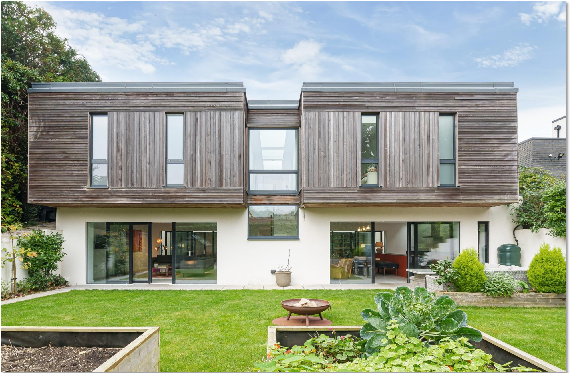
Doctors Commons Road, Berkhamsted HP4 3DR