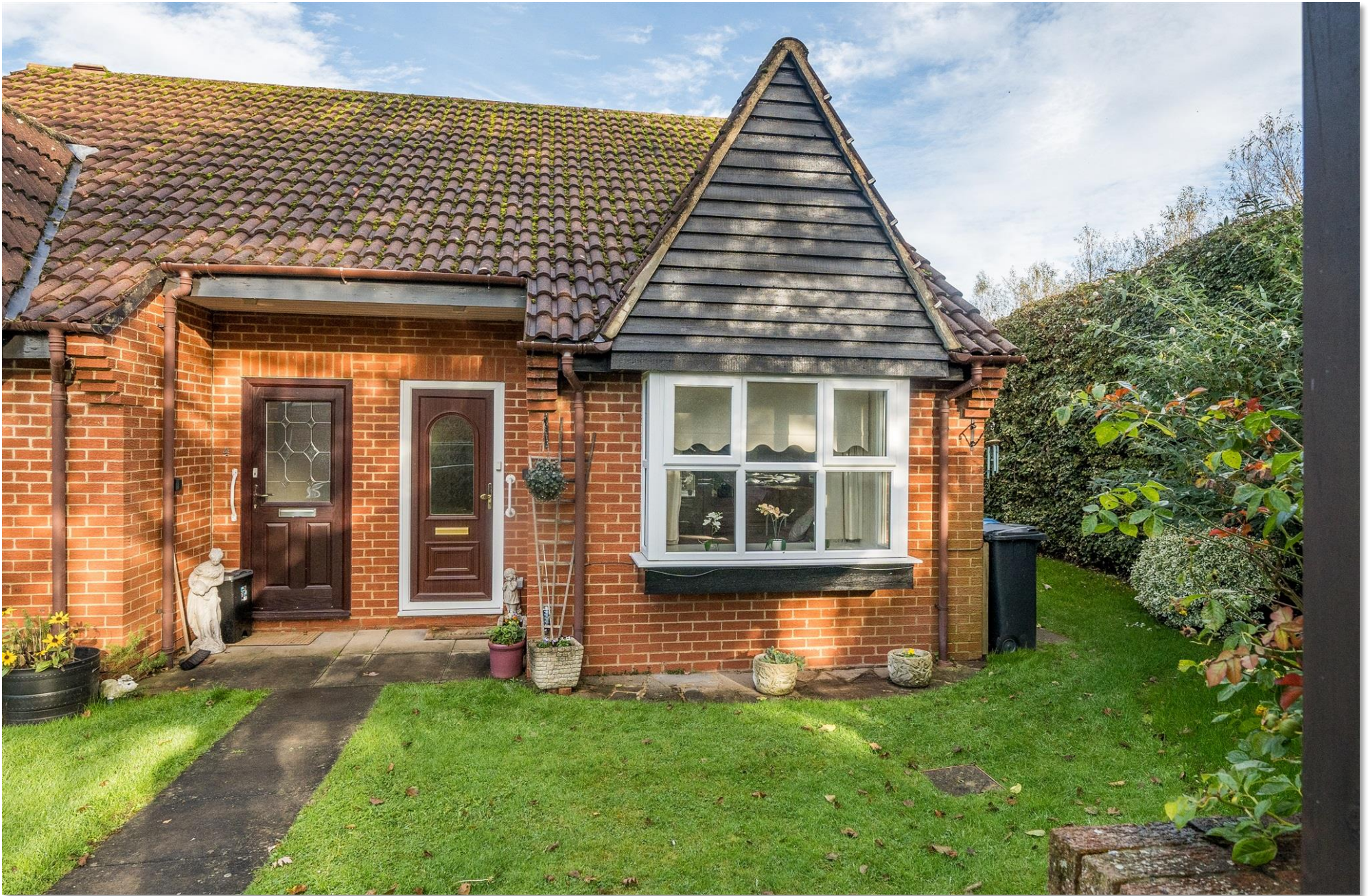
Emerton Garth, Northchurch Berkhamsted HP4 3XJ